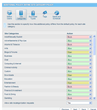
The wizard interface ensures easy policy management