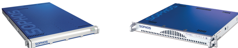
ES4000 and ES1000: fully integrated email gateway protection from Sophos